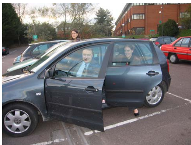
Figure 3-1 Car Sharing

While many people find car share partners through local knowledge of someone who travels a similar journey to them, the use of a car share database can help people to find sharers. People can offer lifts if they have spare seats in the car, and those without a car can look for lifts.