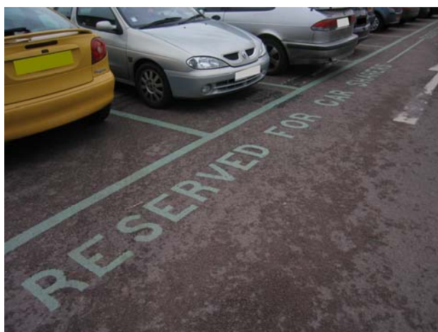
Figure 3-4 Dedicated Car Sharing Spaces

Many businesses already promote car sharing and have systems in place to find people car share partners. Encouraging car sharing through a District wide car share scheme would enable people to find new car sharing partners for regular journeys as well as for one-off journeys. There are a number of potential providers for car share databases, and there is potential to work with local businesses, through their travel plans, to develop a system which works for them, as well as for West Berkshire as a whole.