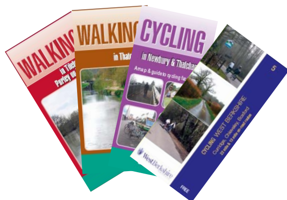
A selection of West Berkshire Council's walking and cycling maps