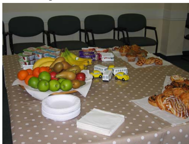
Figure 2-1 Biker's Breakfast