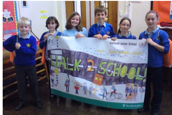
Figure 2-3 Garland Junior School's Walk to School Banner

West Berkshire's SMoTS is reviewed on an annual basis with an update published in August each year.