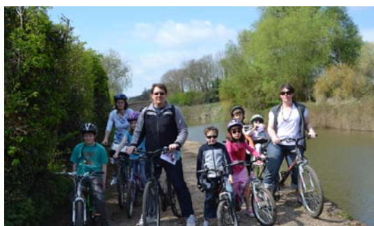
Feel Good Fortnight cycle treasure hunt (April 2011)