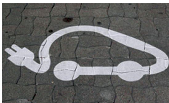
Figure 4-2 Electric vehicle charging point and parking space

There are a number of charging points in the UK, both on-street and in public car parks. Charging could also potentially take place at home, at work, or using a public charging point.