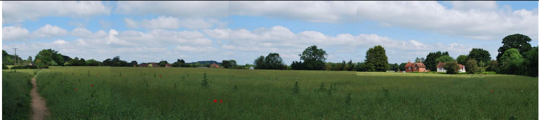
Viewpoint 4: Sparsely settled Manor Lane (right – centre) leading to the small hamlet of Oare (centre – left) – from the public footpath crossing the site. Glimpses of the wider AONB and M4 corridor to the west – north west