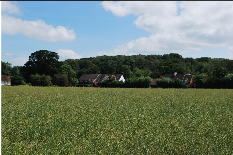
Viewpoint 2: Characteristic view of wooded skyline viewed from the footpath crossing the site. The settlement edge is largely well vegetated