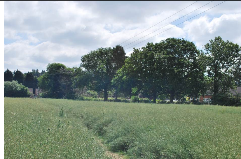
Viewpoint 3: Mature oaks and gappy hedge along southern boundary with the school