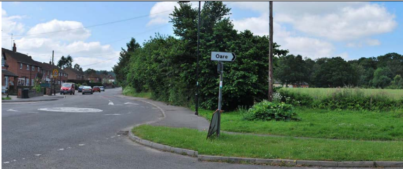
Viewpoint 1: The eastern edge of site (right of the photograph) is adjacent to the settlement with a mature hedge. The school is visible (centre, right) to the south