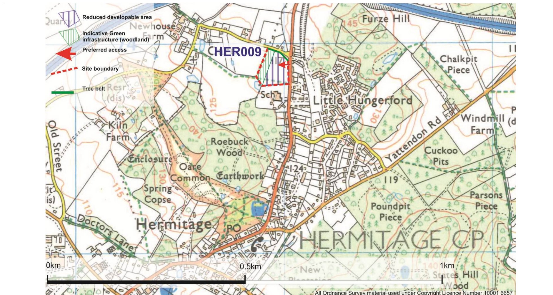
Figure HER009.2: Potential development area, Green Infrastructure and preferred access