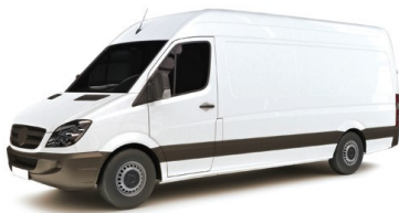
Vans exceeding 3 tonnes