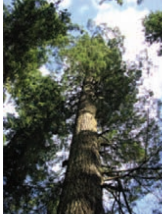
Dughall Mor (tall, dark stranger), the tallest tree in the UK