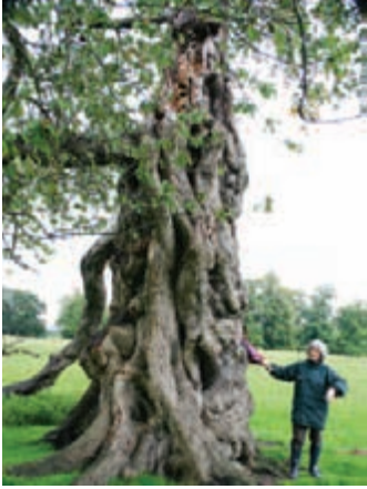
The fattest cherry in the UK