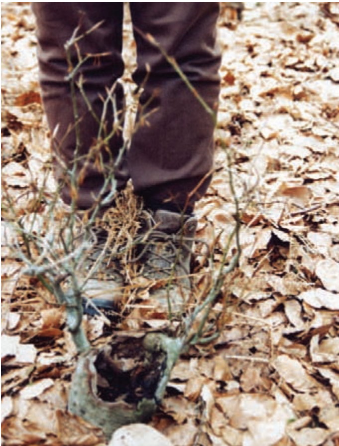
Not all veterans are ancient: a tiny veteran beech tree