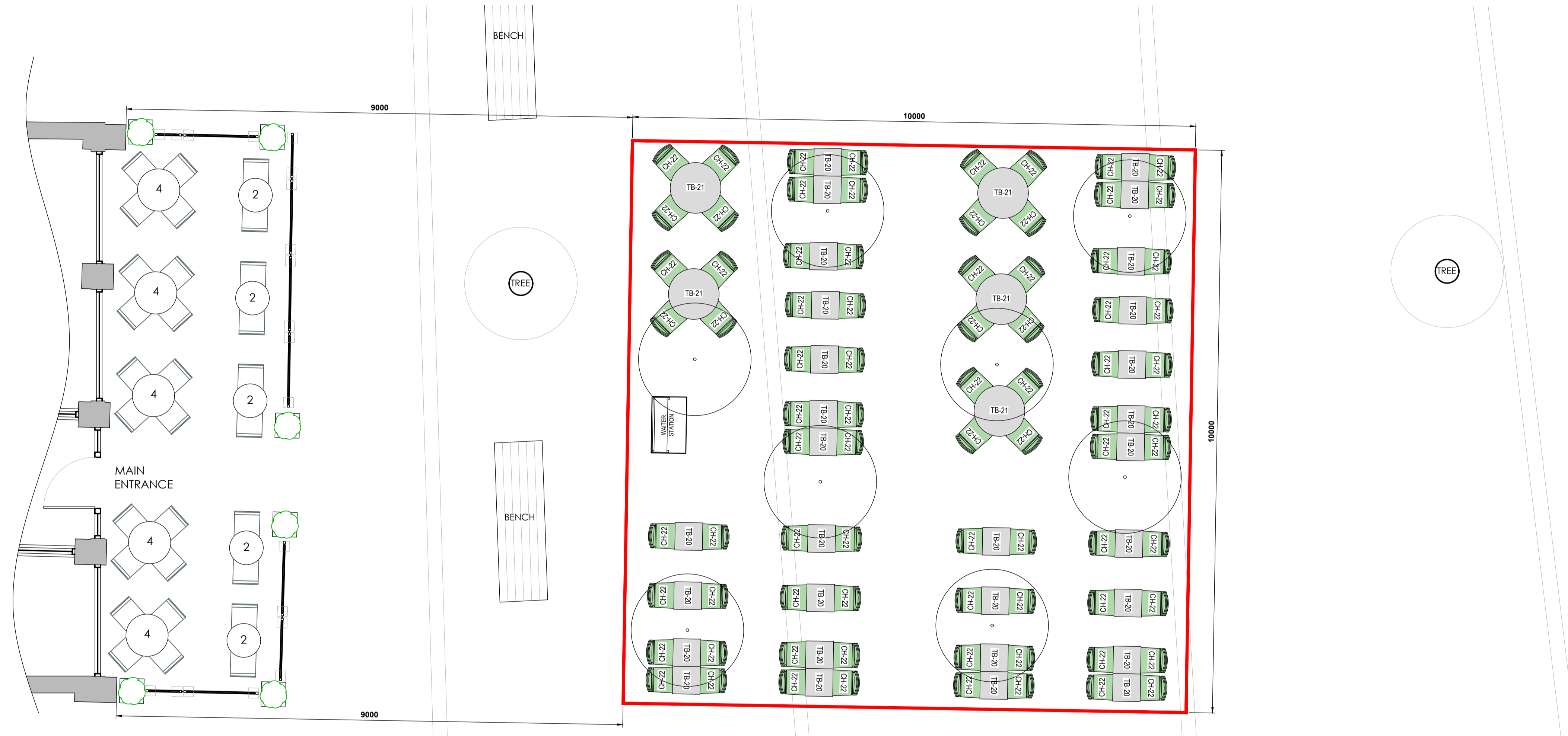
PROPOSED EXTERNAL FRONT SEATING PLAN

GENERAL NOTES ALL DIMENSIONS TO BE CHECKED ON SITE PRIOR TO COMMENCEMENT OF WORKS - PLEASE REPORT ERRORS OR OMISSIONS TO THE ARCHITECT. THIS DRAWING HAS BEEN PRODUCED FOR THE PURPOSES OF PLANNING AND BUILDING REGULATIONS APPROVALS ONLY AND IS NOT INTENDED TO BE A FULL WORKING DRAWING. THIS DRAWING IS TO BE READ IN CONJUNCTION WITH ANY WRITTEN SPECIFICATIONS, SCHEDULES OF WORK AND STRUCTURAL ENGINEERS DETAILS AS APPROPRIATE. THIS DRAWING IS THE COPYRIGHT OF PUMP HOUSE DESIGNS AND ANY FURTHER REPRODUCTION OF THE PLAN IS NOT PERMITTED WITHOUT OBTAINING PRIOR CONSENT. © CROWN COPYRIGHT - LICENCE NO. 100032237