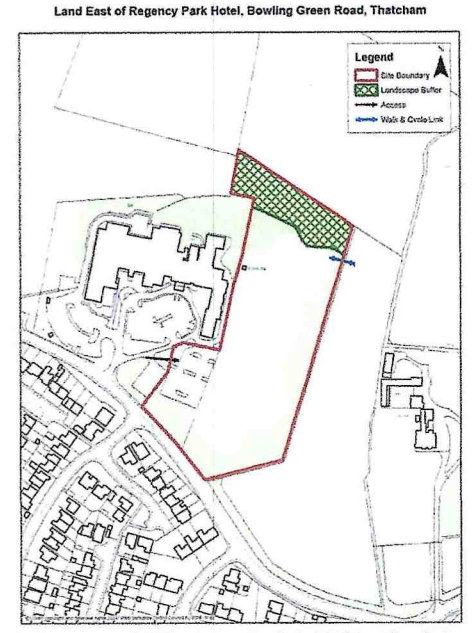
Figure 1: Proposed Site layout of CA17 In Draft Local Plan

It is understood that there is a need for a landscape buffer to prevent adverse impacts on the setting of the AONB and to ensure adequate separation from Cold Ash. However, it is considered that the extent of the landscape buffer proposed could be reduced to accommodate a greater housing density on site whilst maintaining the purpose of the landscape buffer. It would be greatly appreciated if the inspector could take this into consideration and reword part ii. of the policy, to ensure that the site development potential is not restricted by an unnecessary large landscape buffer.